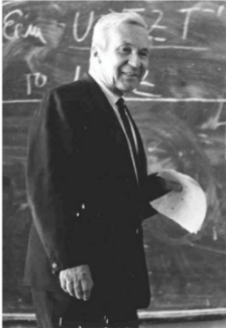
Andrey Kolmogorov 1903 - 1987