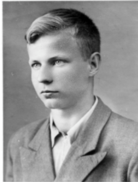
Anatoly Karatsuba 1937 - 2008

Insight: replace one (of the 4) multiplications by (linear time) subtraction